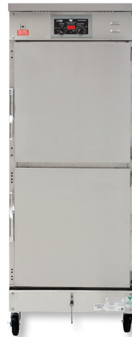
HL4522 CVAP® HOLDING CABINET FULL SIZE MODEL, WITH FAN Electronic Differential Control

CVap equipment complies with domestic and international requirements such as UL, C-UL, UL Sanitation, CE, MEA, and others.