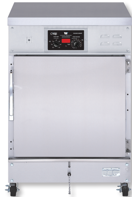
HA4509 CVAP® HOLDING CABINET HALF SIZE MODEL, WITH FAN Electronic Differential Control

CVap equipment complies with domestic and international requirements such as UL, C-UL, UL Sanitation, CE, MEA, and others.