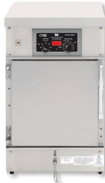
HA4503 CVAP® HOLDING CABINET HALF SIZE UNDER COUNTER MODEL WITH FAN Electronic Differential Control

CVap equipment complies with domestic and international requirements such as UL, C-UL, UL Sanitation, CE, MEA, and others.