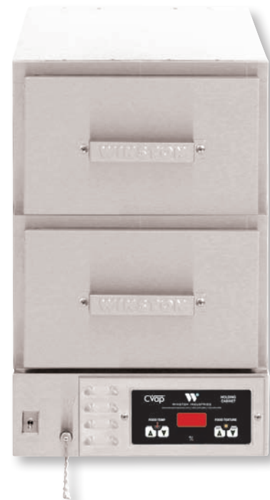
HBB5N2 CVAP® HOLD & SERVE DRAWER WITH FAN

CVap equipment complies with domestic and international requirements such as UL, C-UL, UL Sanitation, CE, MEA, and others.