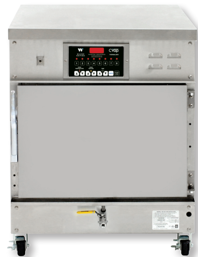
CAT507 CVAP® THERMALIZER OVEN HALF SIZE MODEL WITH FAN 8000 Series, 8 - Channel Electronic Control

CVap equipment complies with domestic and international requirements such as UL, C-UL, UL Sanitation, CE, MEA, and others.