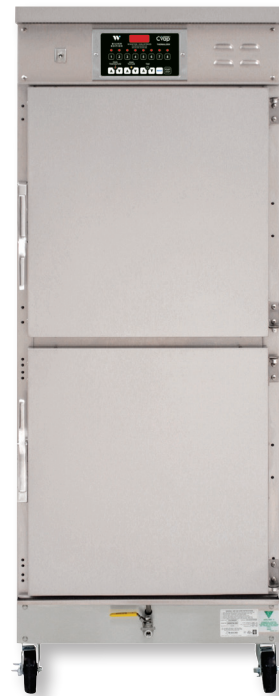
CAT522 CVAP® THERMALIZER OVEN FULL SIZE MODEL WITH FAN

CVap equipment complies with domestic and international requirements such as UL, C-UL, UL Sanitation, CE, MEA, and others.