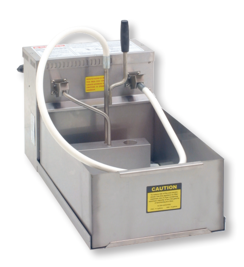
F552A8 SHORTENING FILTER

Winston Shortening Filters are built to comply with all domestic, and most international requirements, such as UL, C-UL, UL Sanitation, CE, MEA, and others.