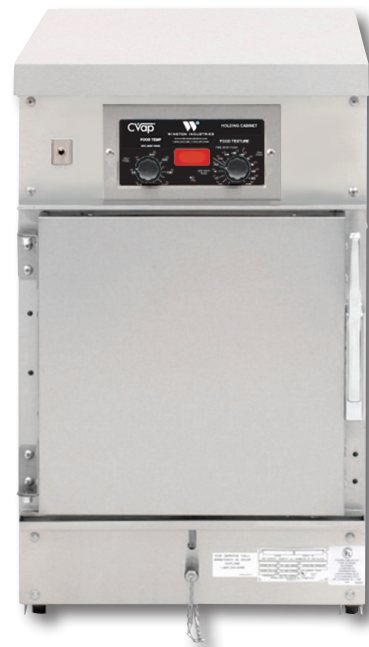
HA4003 CVAP® HOLDING CABINET HALF SIZE, UNDER COUNTER MODEL, FANLESS Electronic Differential Control

CVap equipment complies with domestic and international requirements such as UL, C-UL, UL Sanitation, CE, MEA, and others.